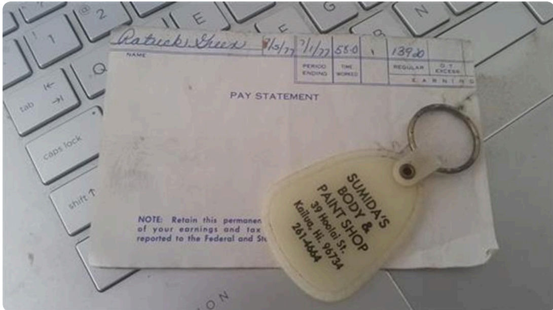
My first paycheck in July 1977... Sumida's Auto Body